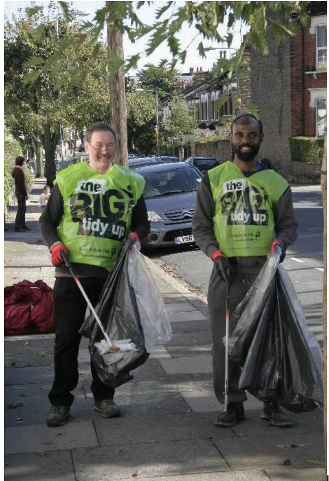
Above and below: Service with a smile as volunteers clean up our streets and green areas on CCRA's Community Day