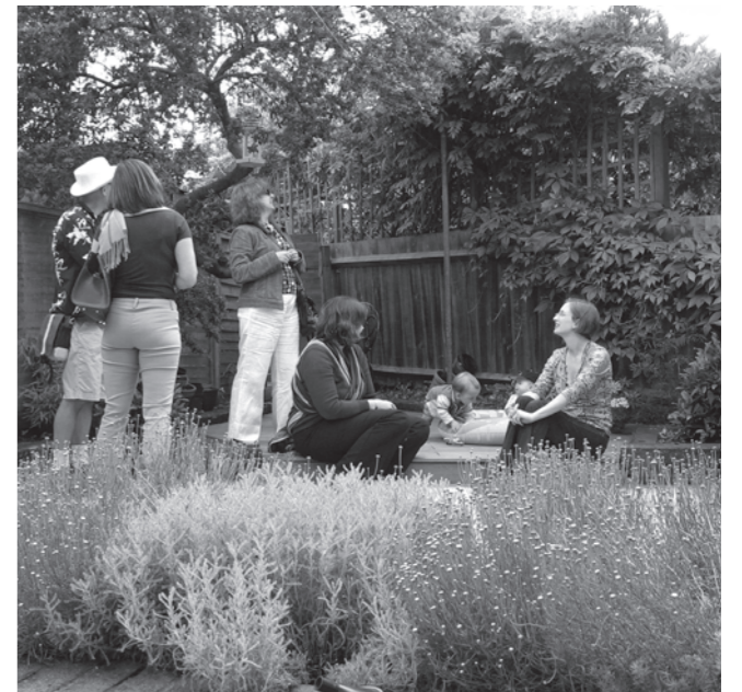
CCRA's Open Garden Event – see page 3 for full story

For a more detailed programme of works see page 2