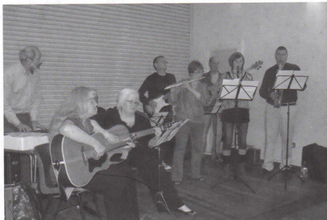
CCRA residents will play at the free ceilidh where you can "get it together" on July 10th.