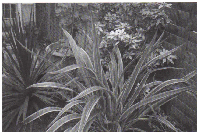
CCRA's open garden event

After the success of last year's Big Clean Up CCRA had been planning a community day on Saturday July 10th. We recently learnt that Greenwich Council is organising a series of 3 events which they are calling Great Get Togethers.