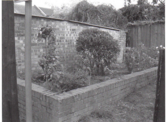
CCRA is greening Charlton

On Saturday 18th September, an enthusiastic group of residents worked hard to transform three neglected areas in Nadine Street, Wellington Gardens and Inverine Road. The pictures on this page show the great improvement that they achieved in just one morning of hard work! We're hoping to continue this work and would welcome suggestions. You might for example have some plants to contribute or you might have some bright ideas such as planting around the base of trees as a neighbouring group have done. Contact Linda Pound on 0208 858 7377 or email events@charltonresidents.org.uk if you would like to help our CCRA area to become greener.