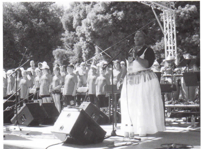
Greenwich Township Choir

On the same day a CCRA ceilidh, with music provided by local residents was held. Our local singing group also provided entertainment.