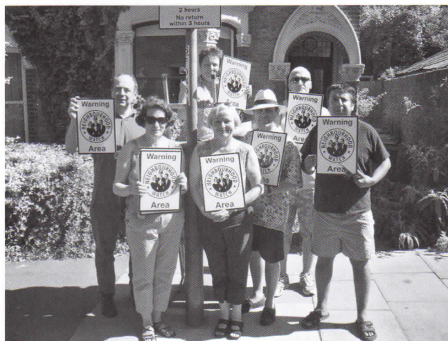
Launching central Charlton neighbourhood watch