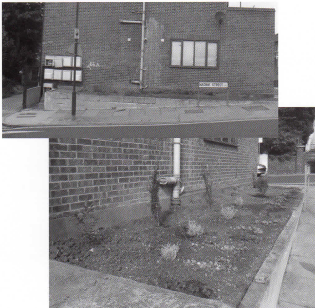
Before and after in Nadine Street