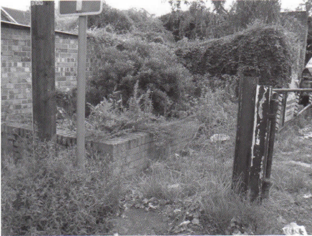
Greening Charlton: Wellington Mews