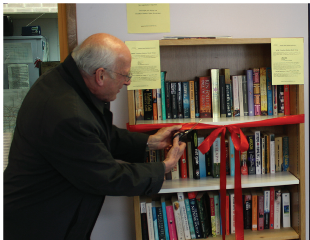
Nick Raynsford MP launches Open Bookcase at Charlton Station

The long-term success of the scheme depends on you using it, picking books and adding books. Children's books in particular are in short supply, so if you have any that your child has outgrown, please consider adding them to the bookcase. If you have more books than the bookcase will take you can drop