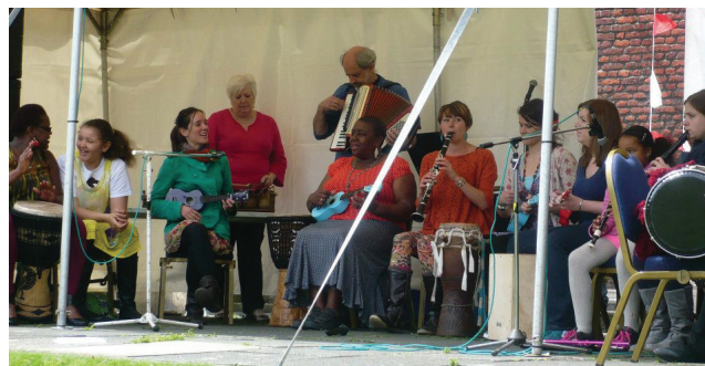
Our music maestros perform at the Charlton Horn Fayre

Our next open gardens day is timed to coincide with the flower and produce show on 15 September. If you would like to open your garden, either for the first time or again, please contact Liz on 020 8265 5454. See page 7 for times and details of gardens to be opened.