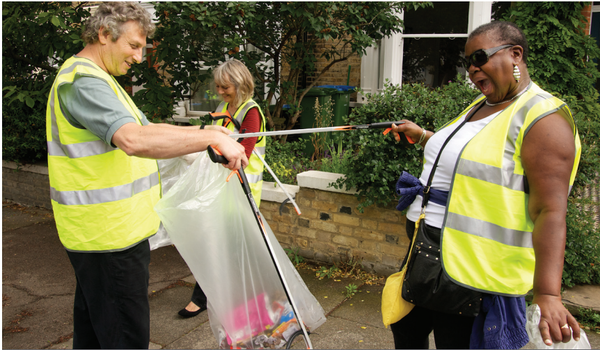
Cleaning up is fun!