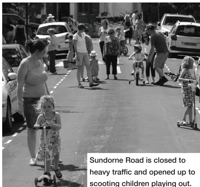
Sundorne Road is closed to heavy traffic and opened up to scooting children playing out.

Council consultation on regular playing-out sessions have favoured continuing the sessions and CCRA representatives will meet council officers in October to discuss practicalities.