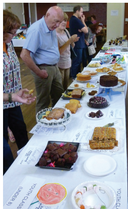
Above Visitors and entrants to the Flower and Produce Show survey the scrumptious cakes, confectionery, jams and jellies. Below Some of this year's winning plants and flower arrangements

Why does CCRA organise this event, you might ask? It's all about building a community – encouraging people to get involved by making fun activities available for all the family; boosting our contribution to the green agenda by inspiring residents to grow vegetables and fruit as well as flowers; and sharing our knitting, craft and cooking skills with our neighbours in a bid to make Charlton a more sociable, friendly place to live: a village in the city.