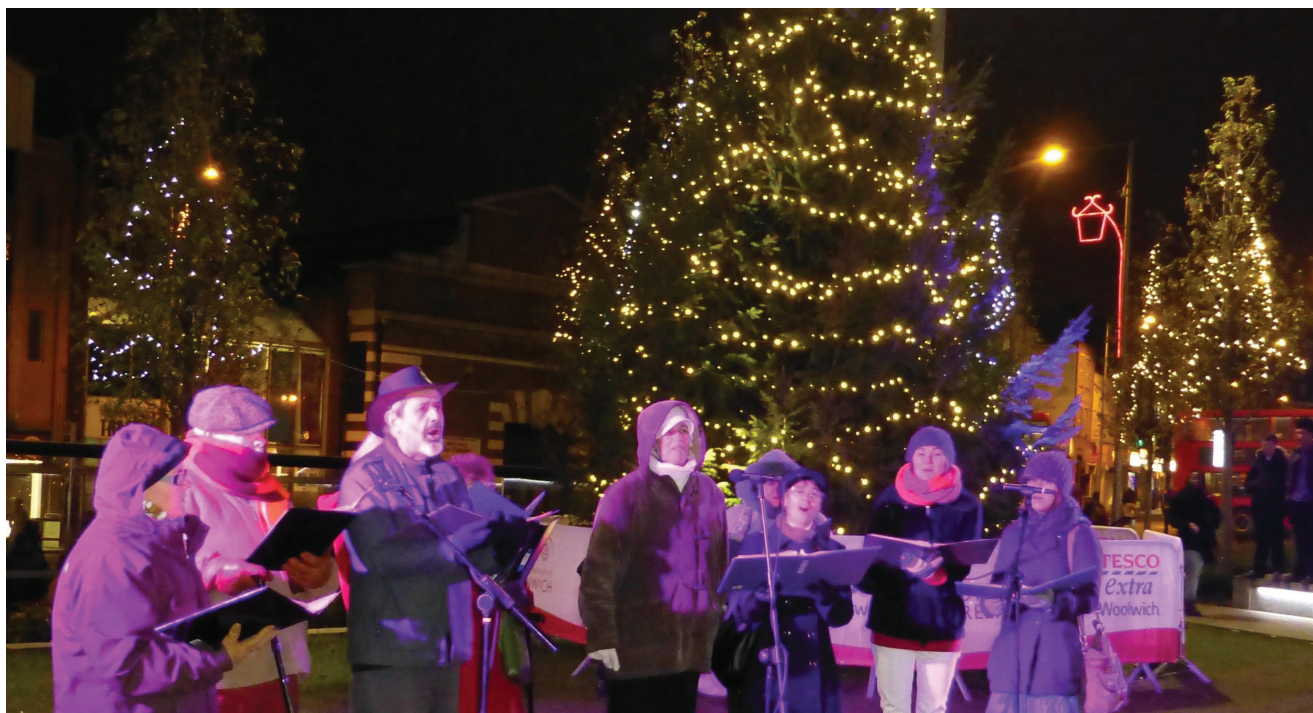
Deep, sweet, crisp and even: our carol singers in full voice last Christmas. They will entertain at the social.

T his is the season to be jolly, so get along to CCRA's Christmas Social at St Richard's Hall on Saturday 5 December. Doors open at 4pm and there will be live music throughout the event from our very own band, SE7. There will be a range of interesting stalls, including locally produced gifts and decorations. Light refreshments including mulled wine, mince pies and samosas will be available at reasonable prices. Every year we raffle a grand hamper filled with seasonal goodies – well worth winning. Come along and support your friends and neighbours. At 6.30 pm you'll have a chance to join in some community carol singing – all your old favourites.