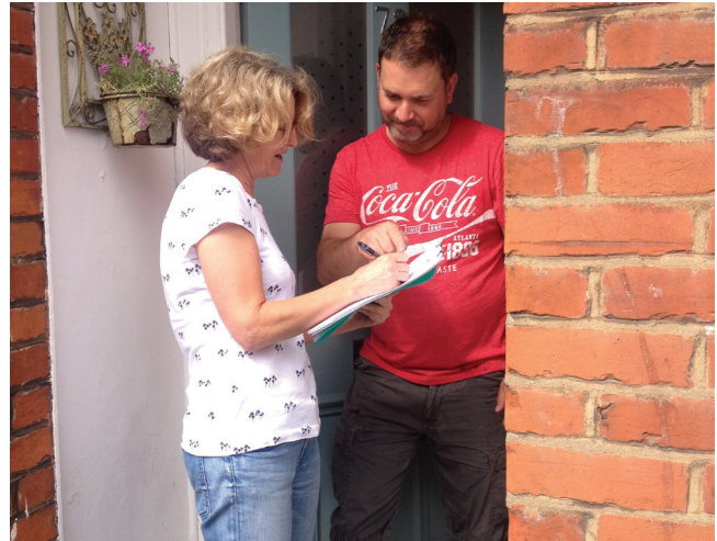
Petitioning on the doorstep in Charlton... is it worth it?

At the time of writing it has taken five years to get an answer to a simple question – basically are petitions worth the paper they are written on? We were told that the delays occurred because a cross departmental policy was required – although this has never materialised. We were told that the delays occurred because the treatment of petitions was to be considered as part of a constitutional review - this