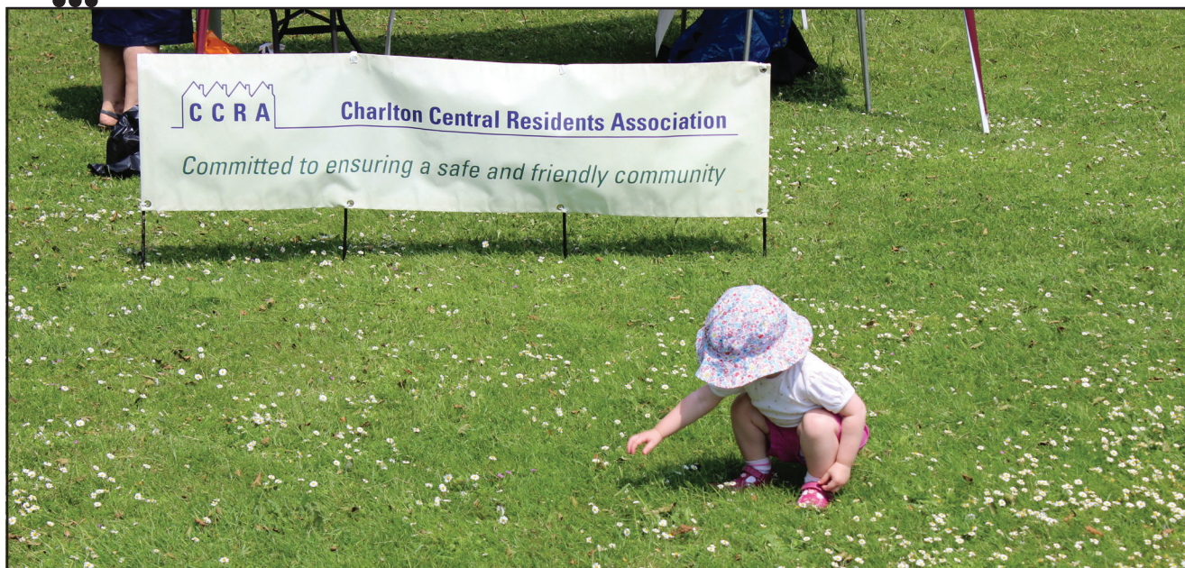
One young visitor to CCRA's Big lunch in Charlton Park gathers daisies in the sunshine, on a June day to treasure - full of music, picnics, neighbours and pleasure.