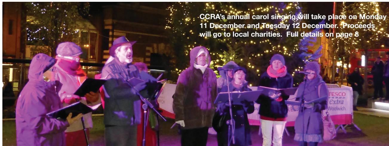
CCRA's annual carol singing will take place on Monday 11 December and Tuesday 12 December. Proceeds will go to local charities. Full details on page 8