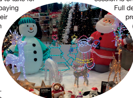
One of B&Q's Greenwich store's Christmas displays with Snowman, Santa and lots of sparkling lights

everyone is welcome but space is limited so please pop into the Old Coffee Shop to reserve your seat. There will be a three course dinner on the day, which is free - donations of food, drink and willing volunteers to help will be very welcome.