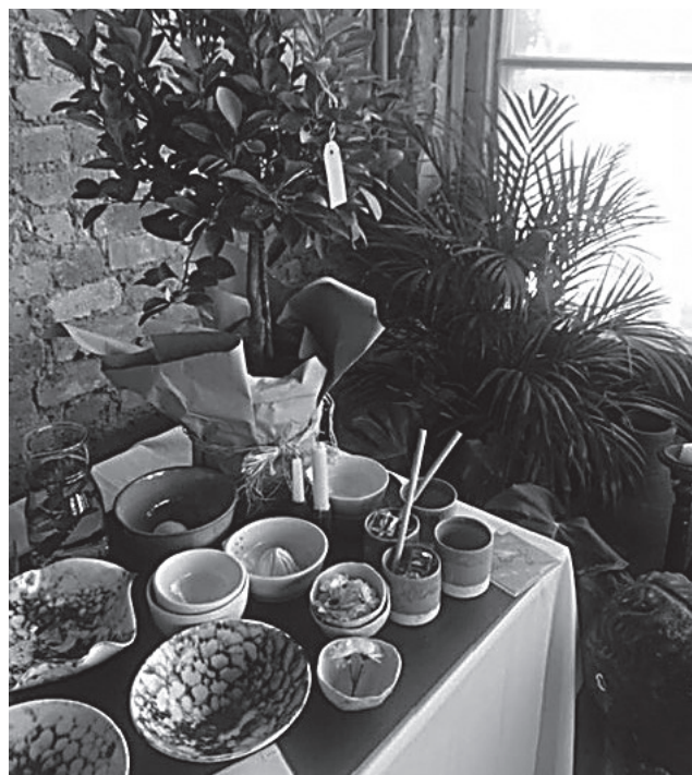
Inviting: craftwork at The Corner @ 96