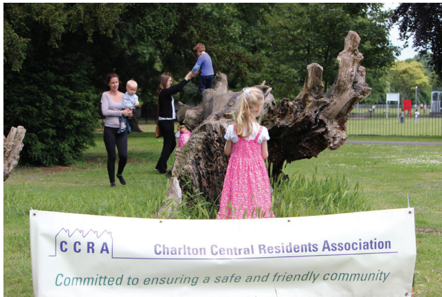
Budding explorers enjoy a natural climbing frame