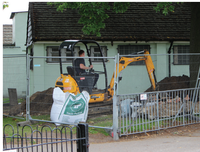
Operation Spruce Up at Charlton Park Pavilion

The Council has agreed a budget to refurbish and modernise the toilets at the pavilion near the cafe and it will go out to tender in the next few weeks. Work has already started on the drains and on painting the outside and the Council is anxious to assure us it is taking Grapevine's questions seriously. We will report in the next issue on their progress and responses on issues such as timing, upkeep and cleaning, baby-changing facilities and proposals to turn one pavilion room into a meeting room for the community. With your support we will keep up the pressure and will keep you posted.