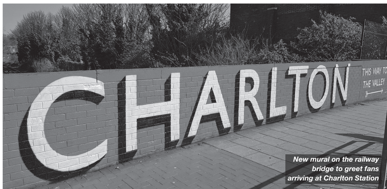
New mural on the railway bridge to greet fans arriving at Charlton Station