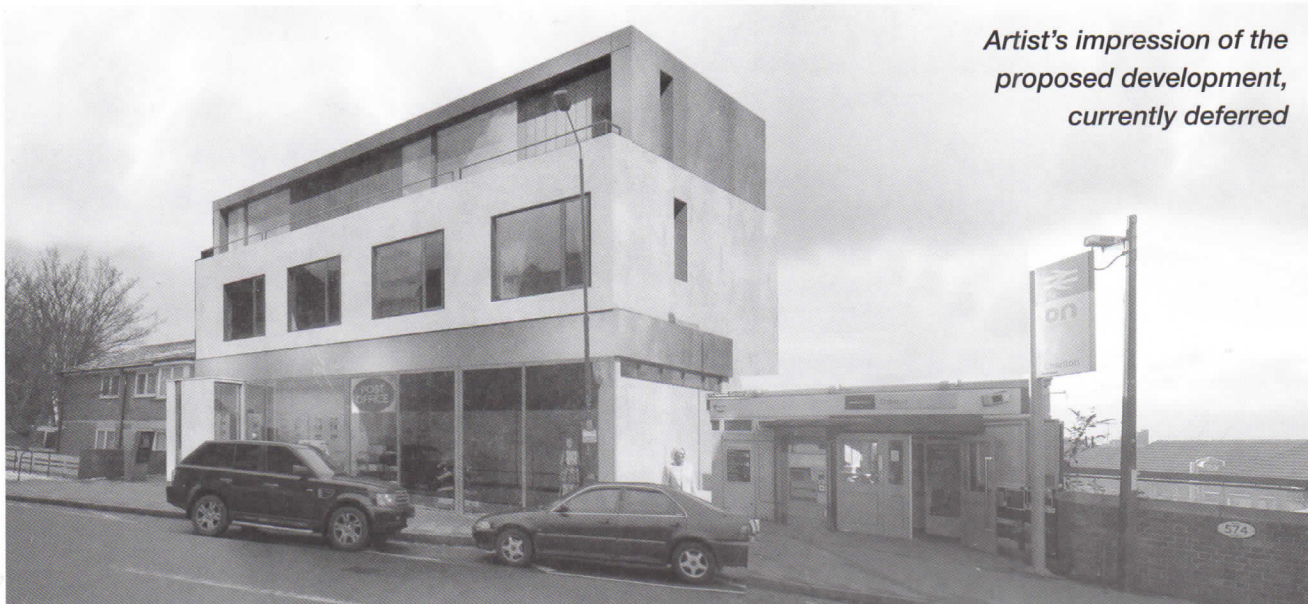
Artist's impression of the proposed development, currently deferred