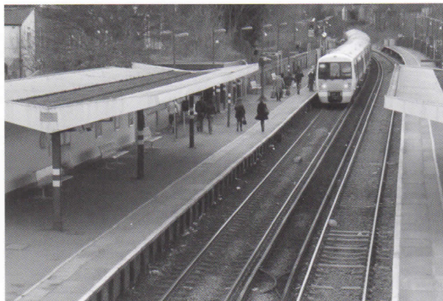
(Above) Passengers run along the platform to try to board one of Network SouthEast’s new, short, trains.

The good news is that we now have a better train service from Charlton. The new timetable gives us 23 trains in the morning and evening peak, up from just 16 rather crowded trains. Going into London from Monday to Saturday for much of the day there are eight trains an hour and even on Sunday at times there are six. For part of the day 25 years ago it was only two trains an hour into town during the day