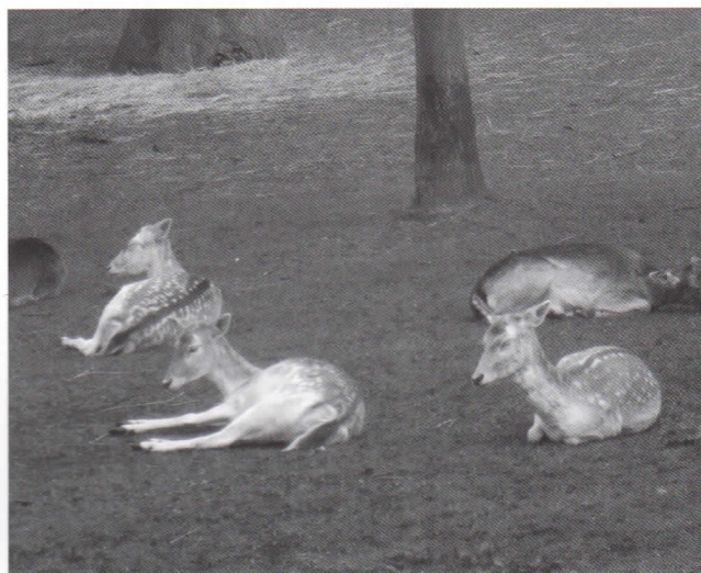
Animals in Maryon Wilson Park - funding in budget only until 2012.

The impact on social services and on services for adults is also not yet clear. They depend on council funding and health service resources, on voluntary sector input and on large numbers of agency staff. There are proposals to out-source youth services later in the year; the council is already seeking expressions of interest. Grapevine will seek to clarify the position as the year progresses and in particular will focus on services and organisations in Charlton. If you have information which you feel should be passed on we would like to hear from you.