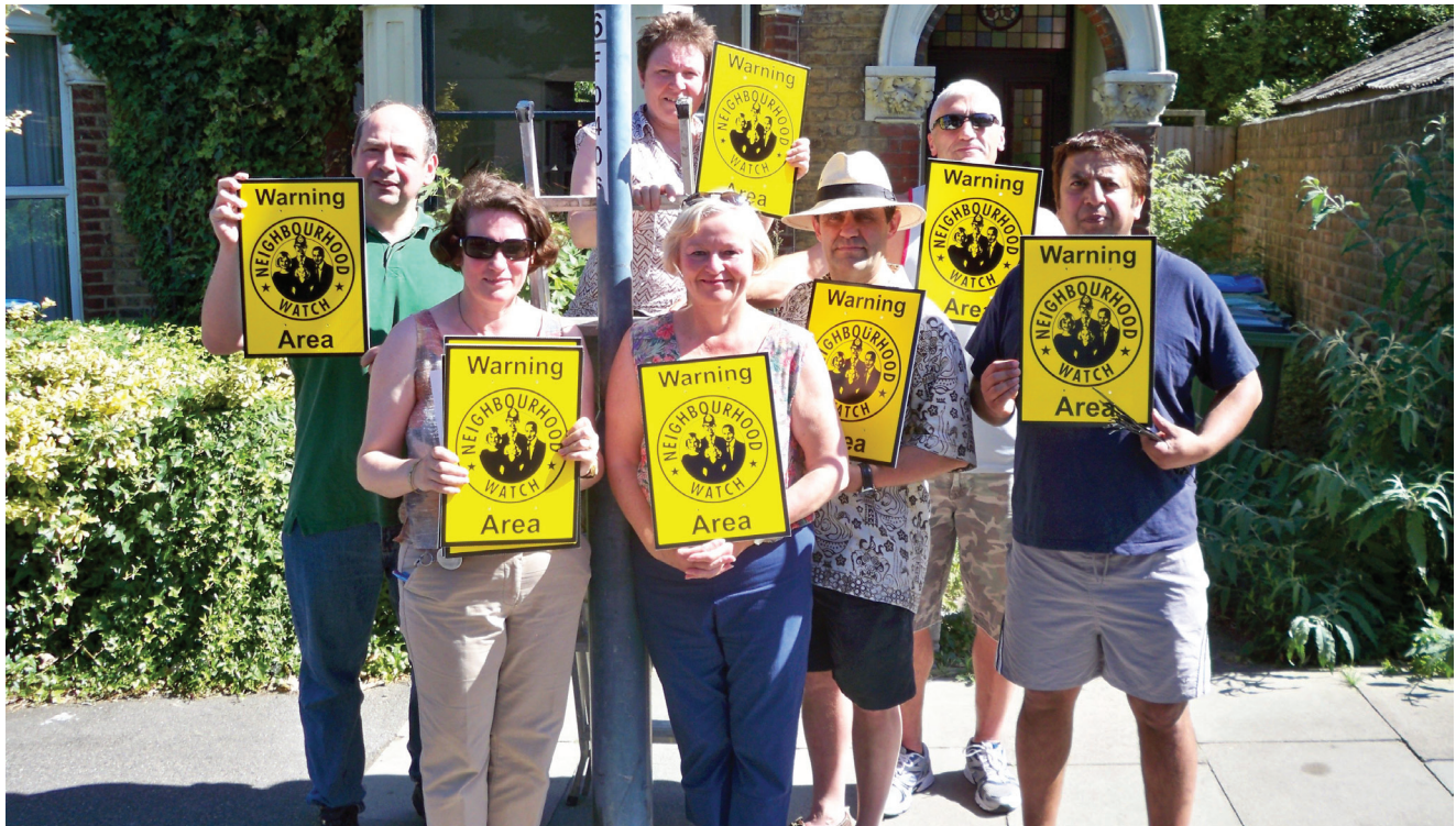
Watch out! CCRA residents send out an emphatic reminder that we are a Neighbourhood Watch area